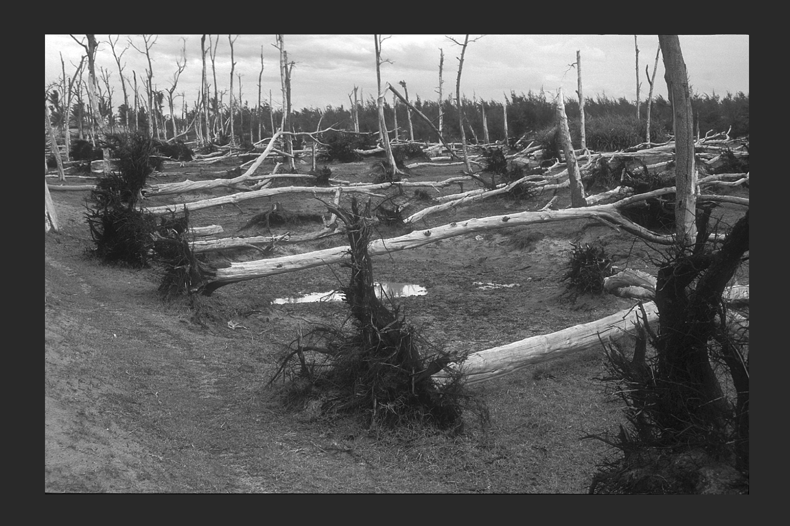
Casuarina plantations in Orissa